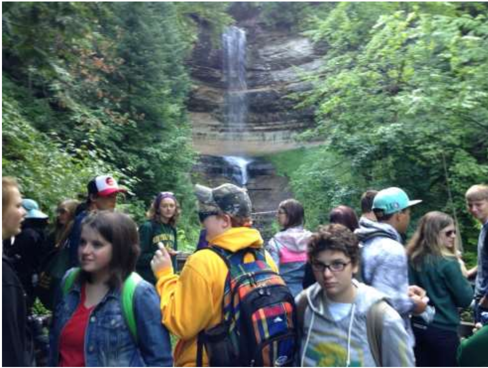
Picture 2: Tourists at the Munising Falls in the Pictured Rocks National Lakeshore

Some key components leading to the success of ecotourism in Pennsylvania were the organization of local stakeholders, efforts to develop businesses, preservation of natural resources and conducting business in the interest of the local culture. In order for ecotourism ventures to be considered successful, local communities must have some measure of control and share equity in the benefits (Schevyns, 1999).