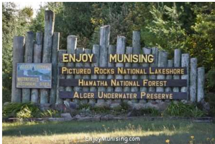
Picture 1: Enjoy Munising Display Board for the Pictured Rocks National Lakeshore, Hiawatha National Forest and the Alger Underwater Preserve

Munising's economic history has been largely dependent on timber industry, trade and commercial fishing. Until recently, Munising had made little effort to develop or update its infrastructure to support a tourism economy and the local desire was to remain a sleepy Upper Michigan town. However, in 1966, the United States declared over 114 square miles of land along the south shore of Lake Superior, the nation's first National Lakeshore to be managed by the National Park Service (NPS). The establishment of Pictured Rocks National Lakeshore was intended to preserve the shoreline and bring tourists to the area in order to boost the local economy. In 1990, Grand Island, a harbor located in the center of Munising Bay, was converted into a National Recreation Area and managed by the United States Forest Service (USFS). Owing to both these endeavors, Munising area has experienced a significant increase in nature-based tourism in the recent times. Summer visitation has increased 30% since 2014 and 97% since 2011 (USFS, 2015).