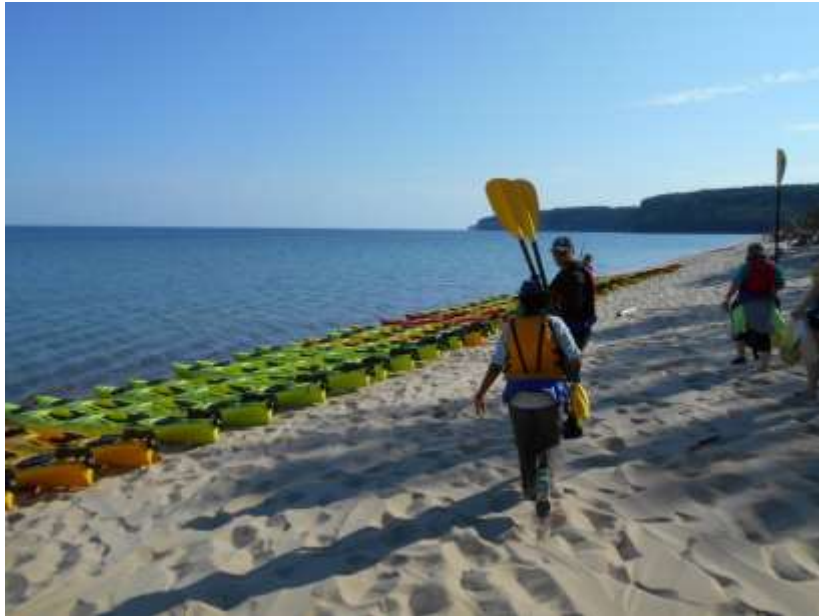
Picture 5: Kayaking Business Expansion at Pictured Rocks National Lakeshore

and then back in. It seemed like we spent about half our time paddling and the other half waiting for the people in front of us to finish what they were doing (all the while rushing through the various "attractions", when it was our turn, as we were mindful that there were many others waiting their turn behind us as well).”