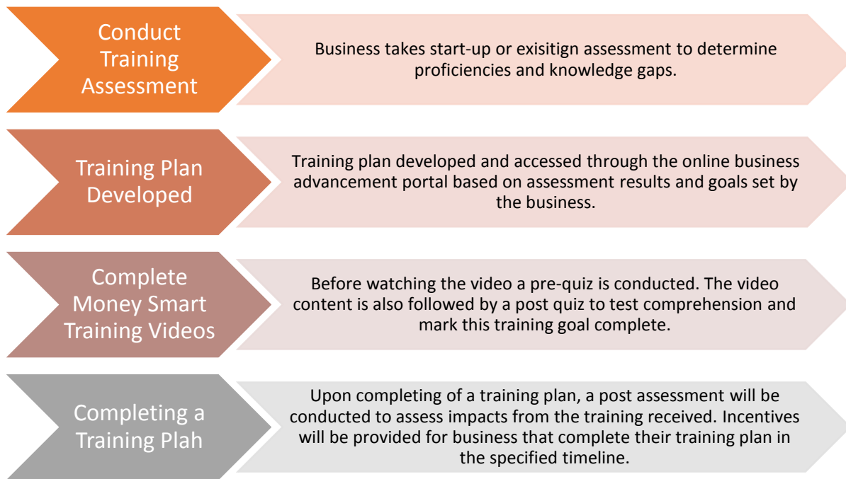
Figure 2: Technical Assistance and Training Work Plan