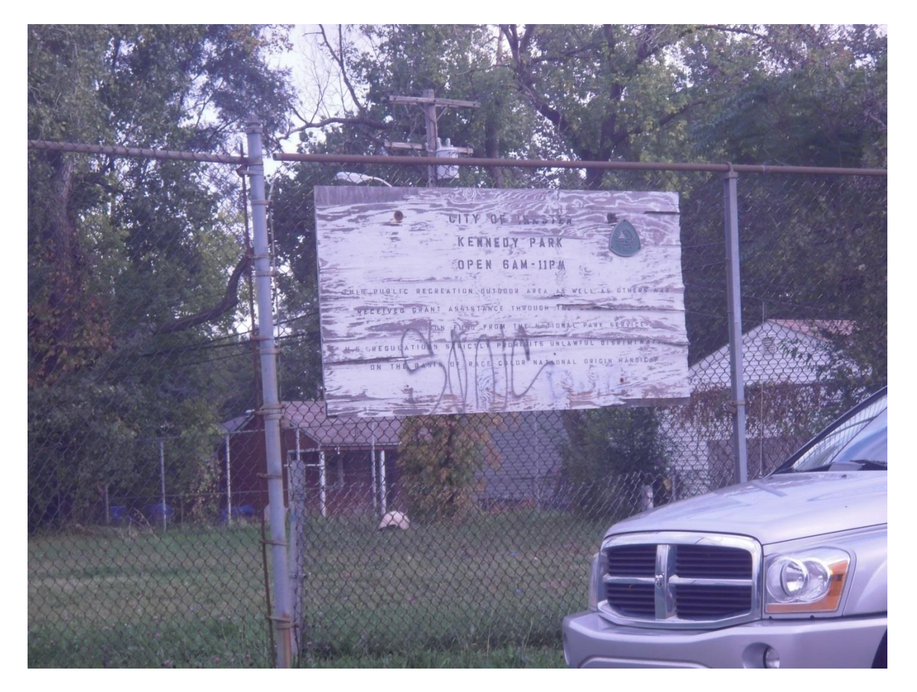
Figure 16. Disused ball diamond and vandalized, decrepit entry sign to Kennedy Park showing LWCF logo.