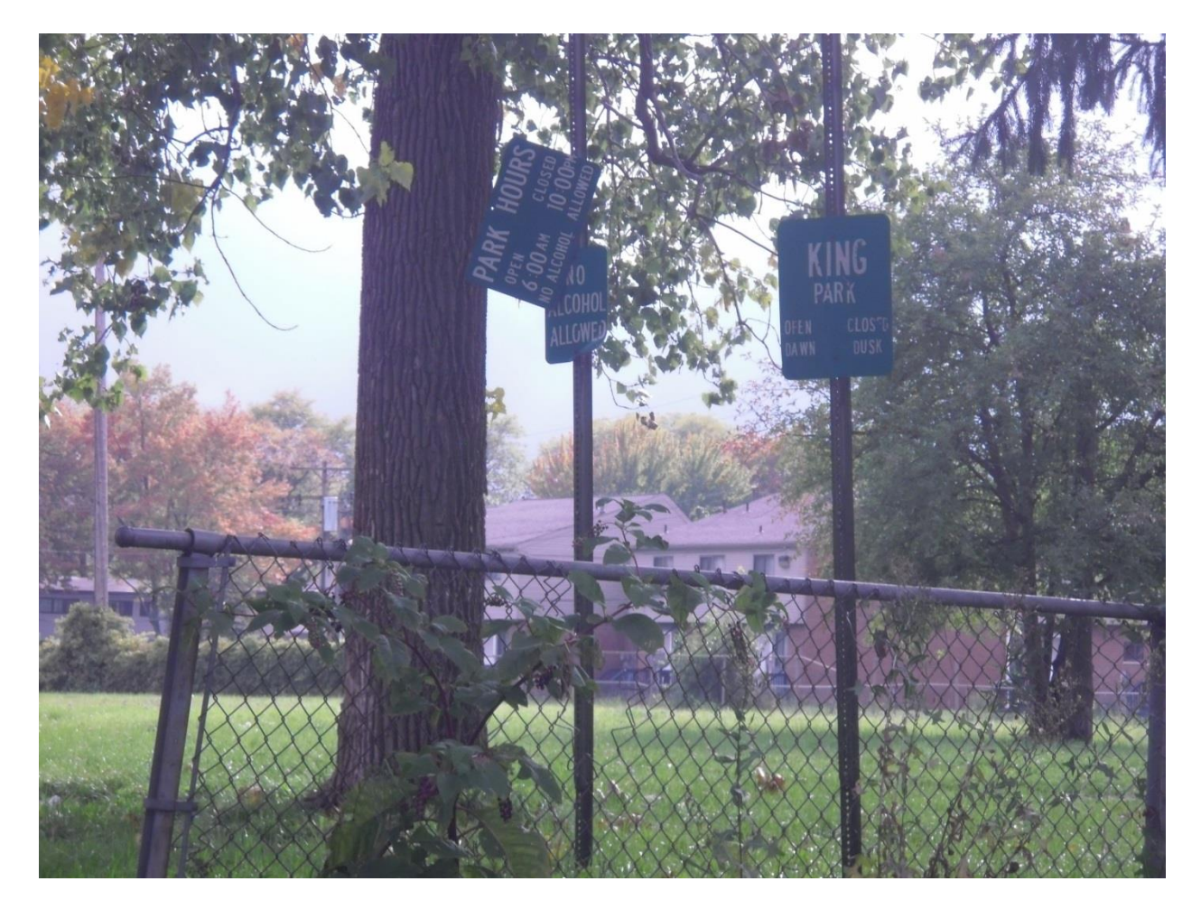
Figure 11. Signage at King falling into disrepute in Summer 2014. No LWCF acknowledgement sign found and all facilities in poor condition.