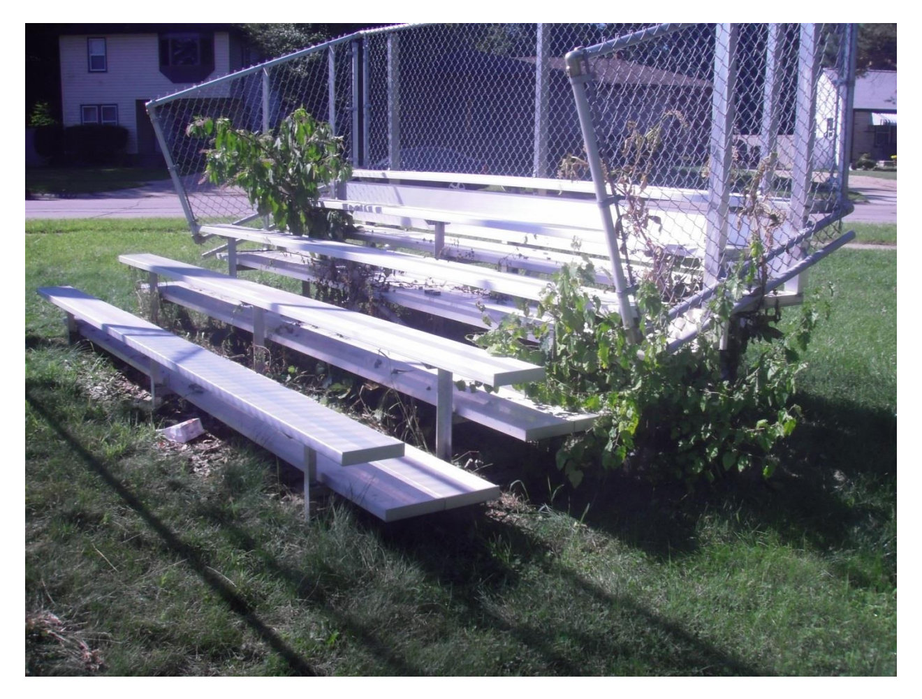
Figure 6. Disused bleachers in Wheatley Park at ball field with trees protruding during summer 2014.