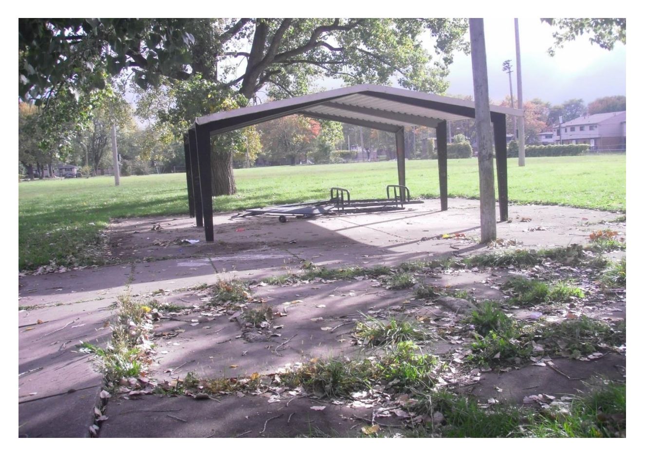
Figure 12. Vandalized picnic pavilion with upside down table and unknown other equipment on concrete floor at King Park in Summer 2014. Note light poles for unused ball diamond in background.