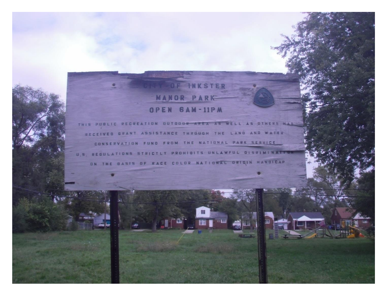
Figure 20. Manor Park sign with LWCF logo and playscape which is tagged with graffiti on underside of slide. Grass is approximately 12" high.