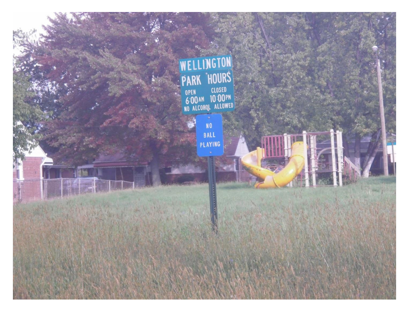
Figure 21. Knee high grass at Wellington Park and sign prohibiting ball playing with playscape in background with graffiti on underside of slide on left.