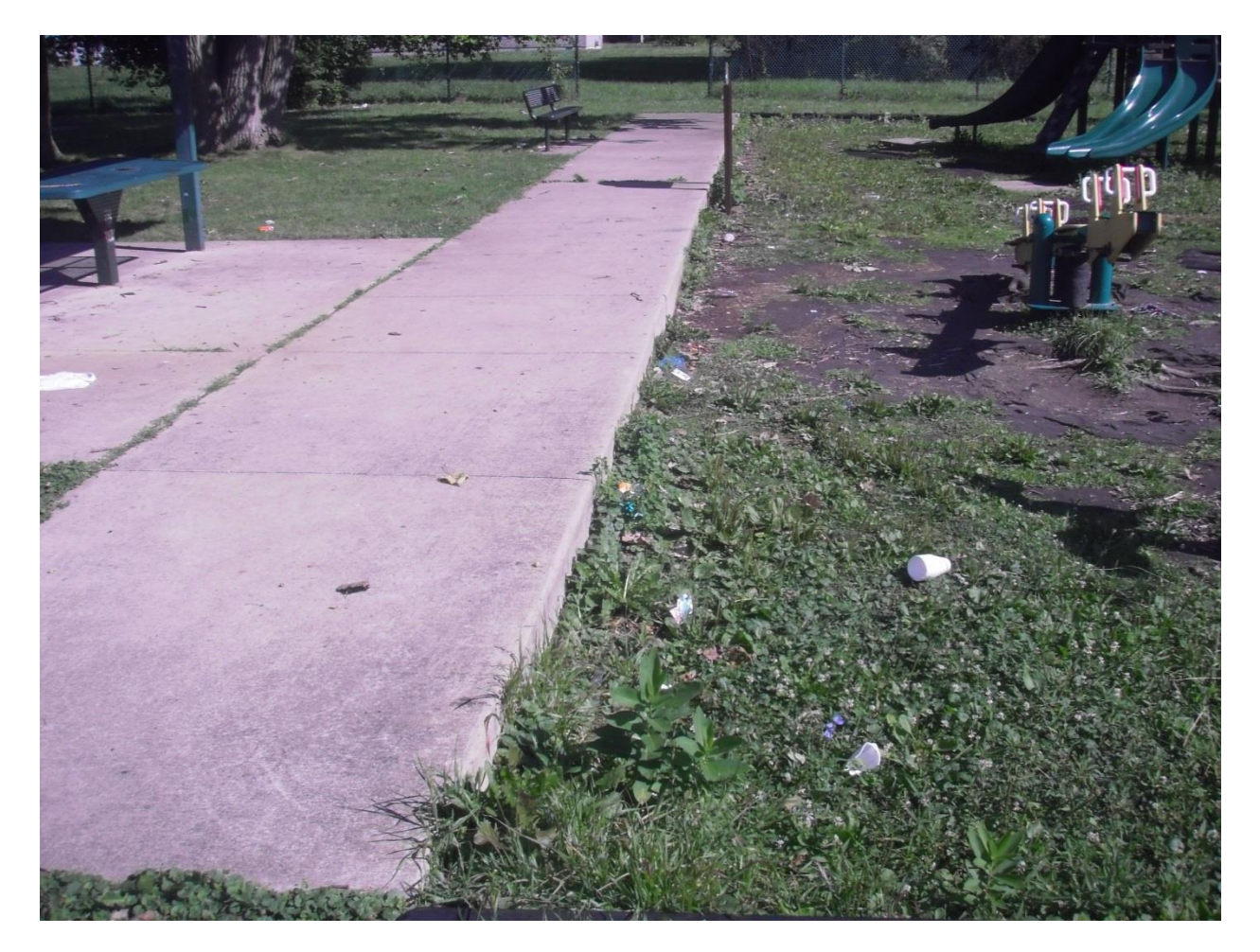
Figure 18. Inaccessible design for playground at Dartmouth with 4-6 inch dropoff to playground from sidewalk. In addition playground has litter, rolled filter fabric and lacks evidence of maintenance.