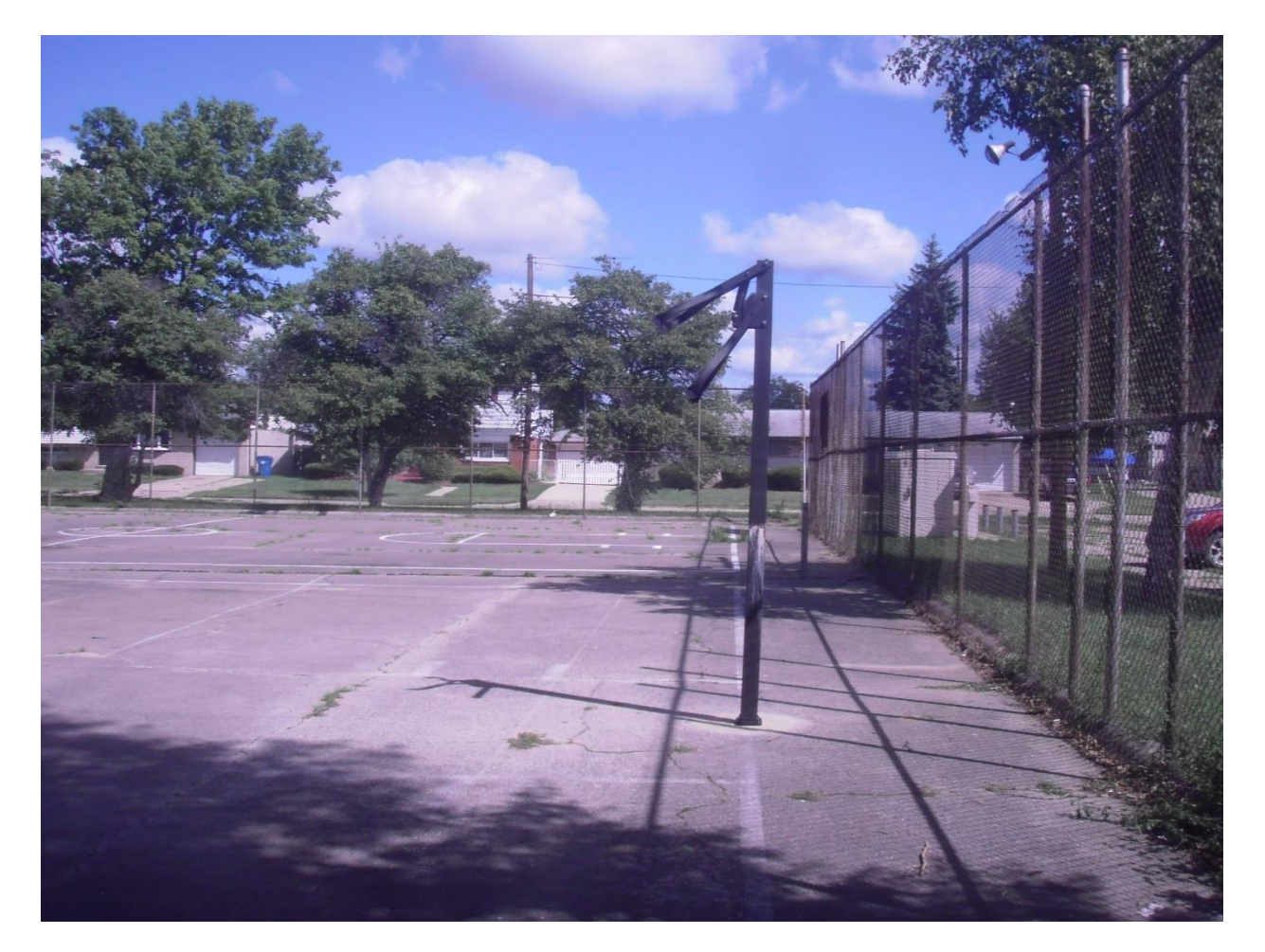
Figure 5. Lomoyne former tennis courts reconditioned for basketball and then stripped of backboards and rims by vandals.