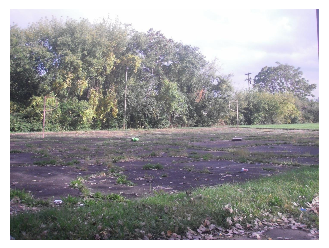
Figure 10 . Abandoned, obsolete basketball court at King Park in Summer 2014.