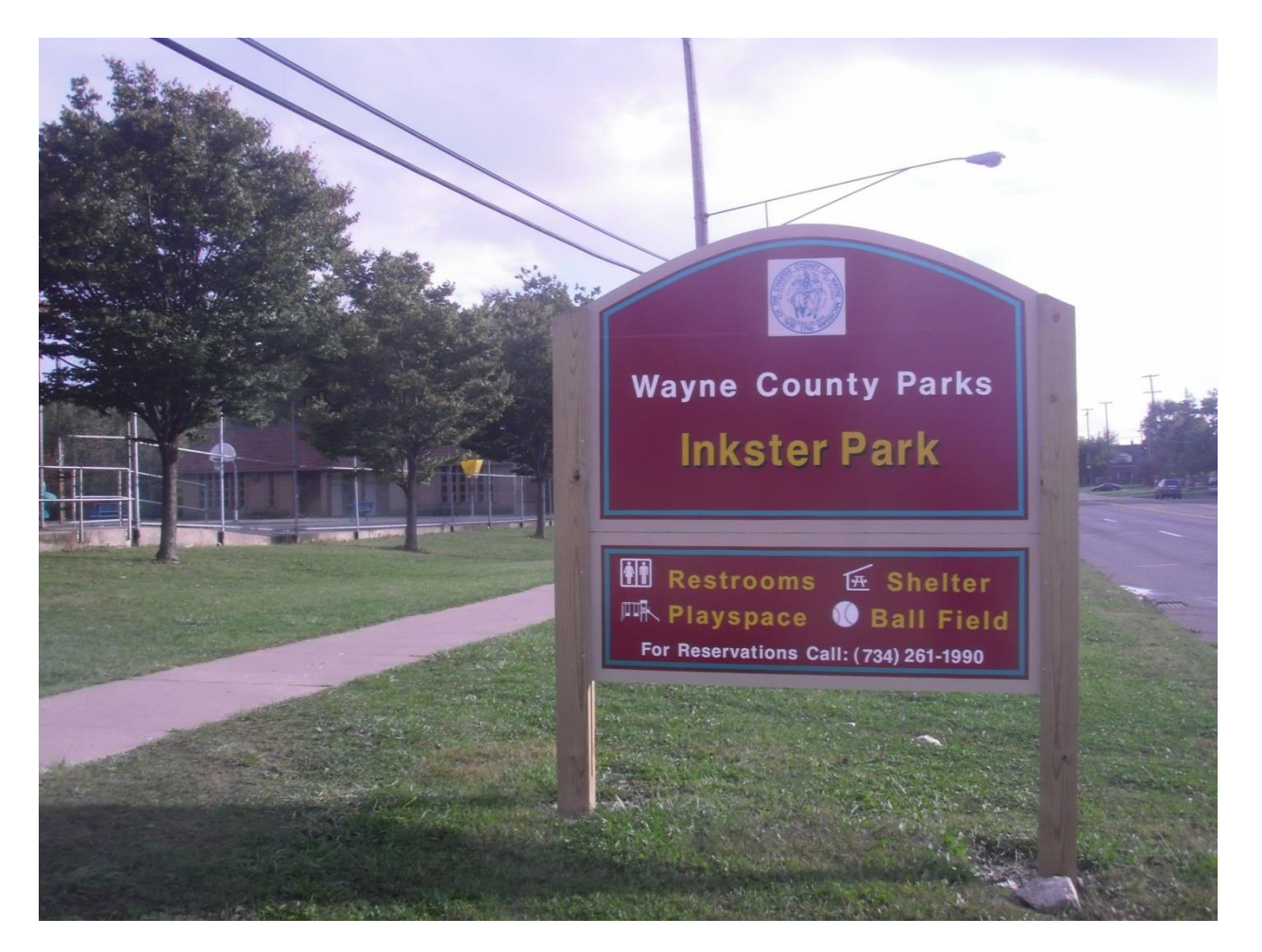
Figure 15. Wayne County Park sign at site of Inkster CSO, showing its management by Wayne County Parks.