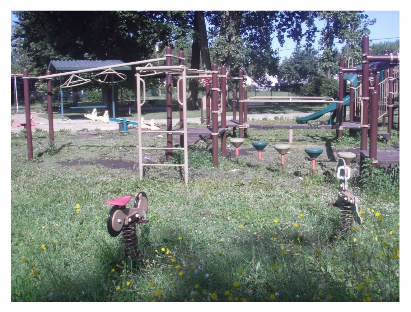
Figure 17. Overgrown playground at Dartmouth with newer playground equipment and a lack of maintenance.