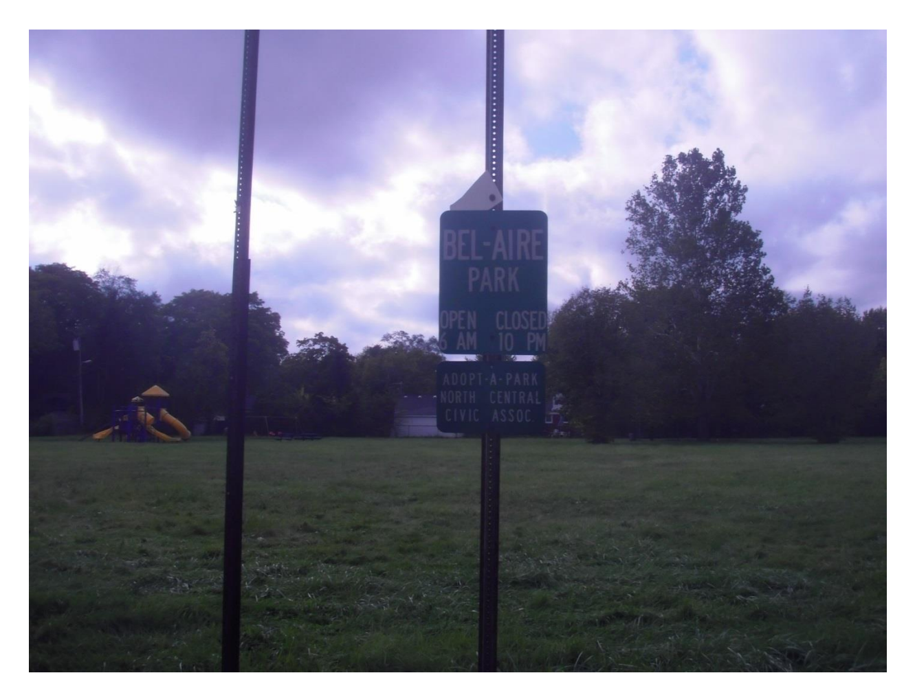
Figure 19. Sign for Bel Aire Park with playscape in background and adopt a park partner North Central Civic Association named, but actions not apparent.