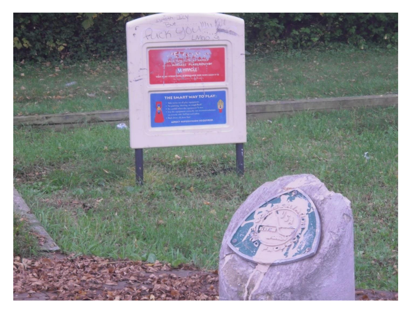
Figure 13. Vandalized grant recognition signs at Demby playground for both the Miracle Network that apparently sponsored the playground and LWCF. In addition the playground is in a depression that fills with water during rainy periods and is inaccessible to the disabled.