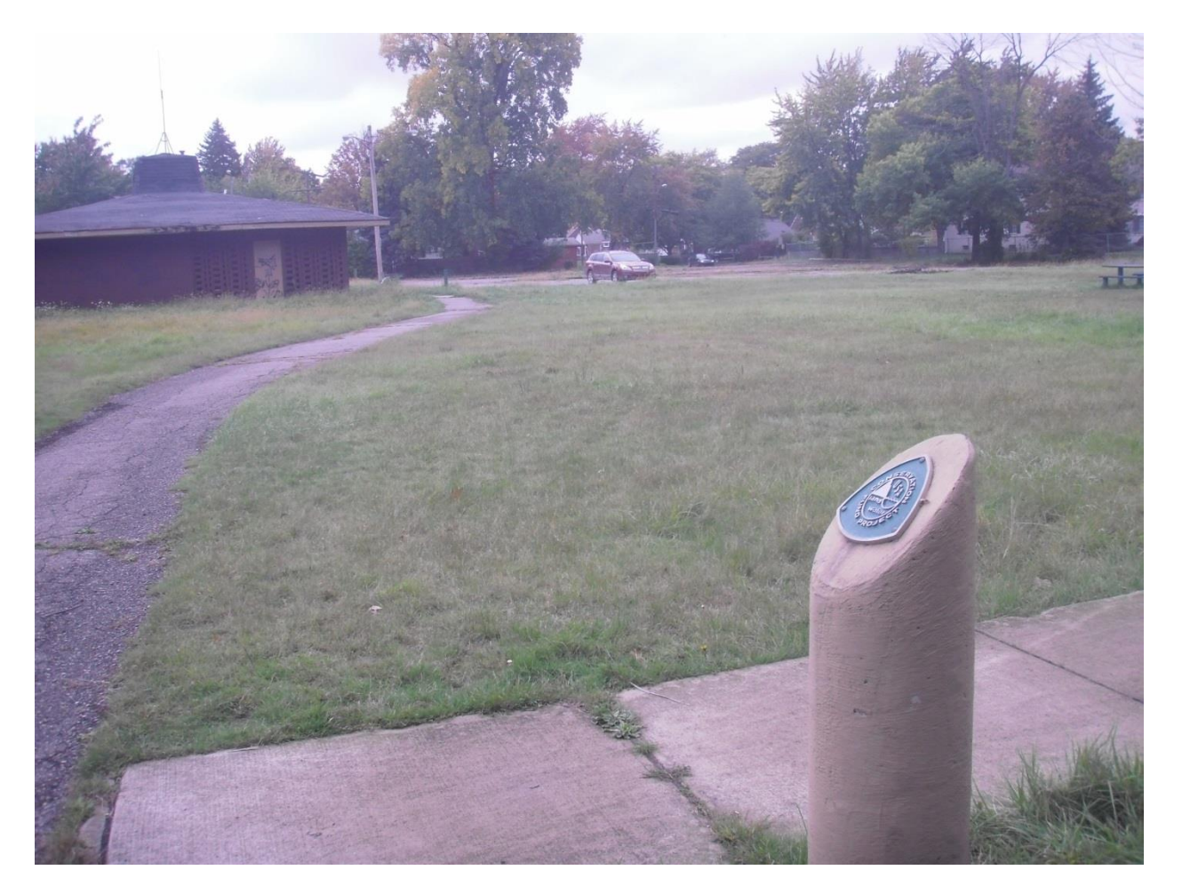
Figure 8. Westwood Park with LWCF logo on path to playground and vandalism on padlocked restroom facility near parking area Summer 2014.