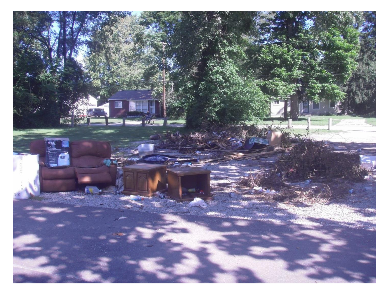
Figure 7. Trash dumping adjacent to Wheatley Park basketball courts in Summer 2014.