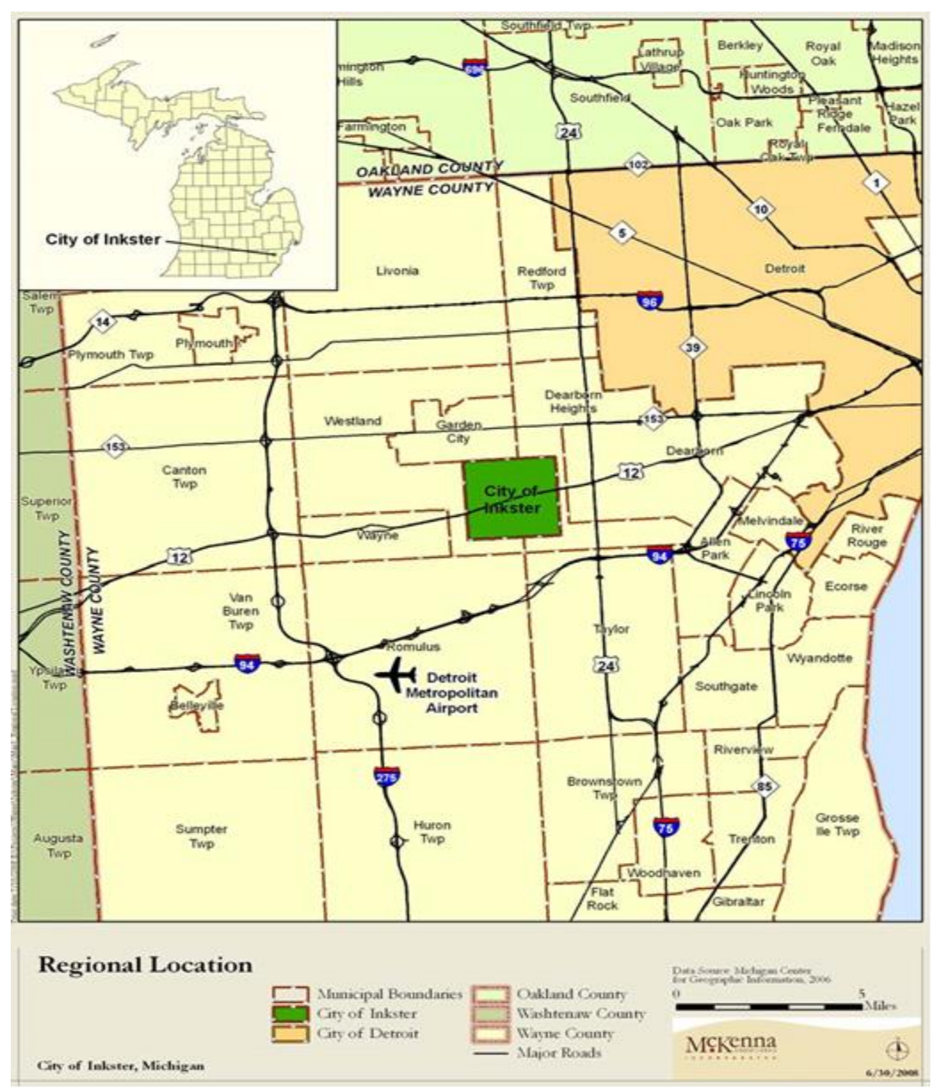
Figure 1. Locational map for City of Inkster.