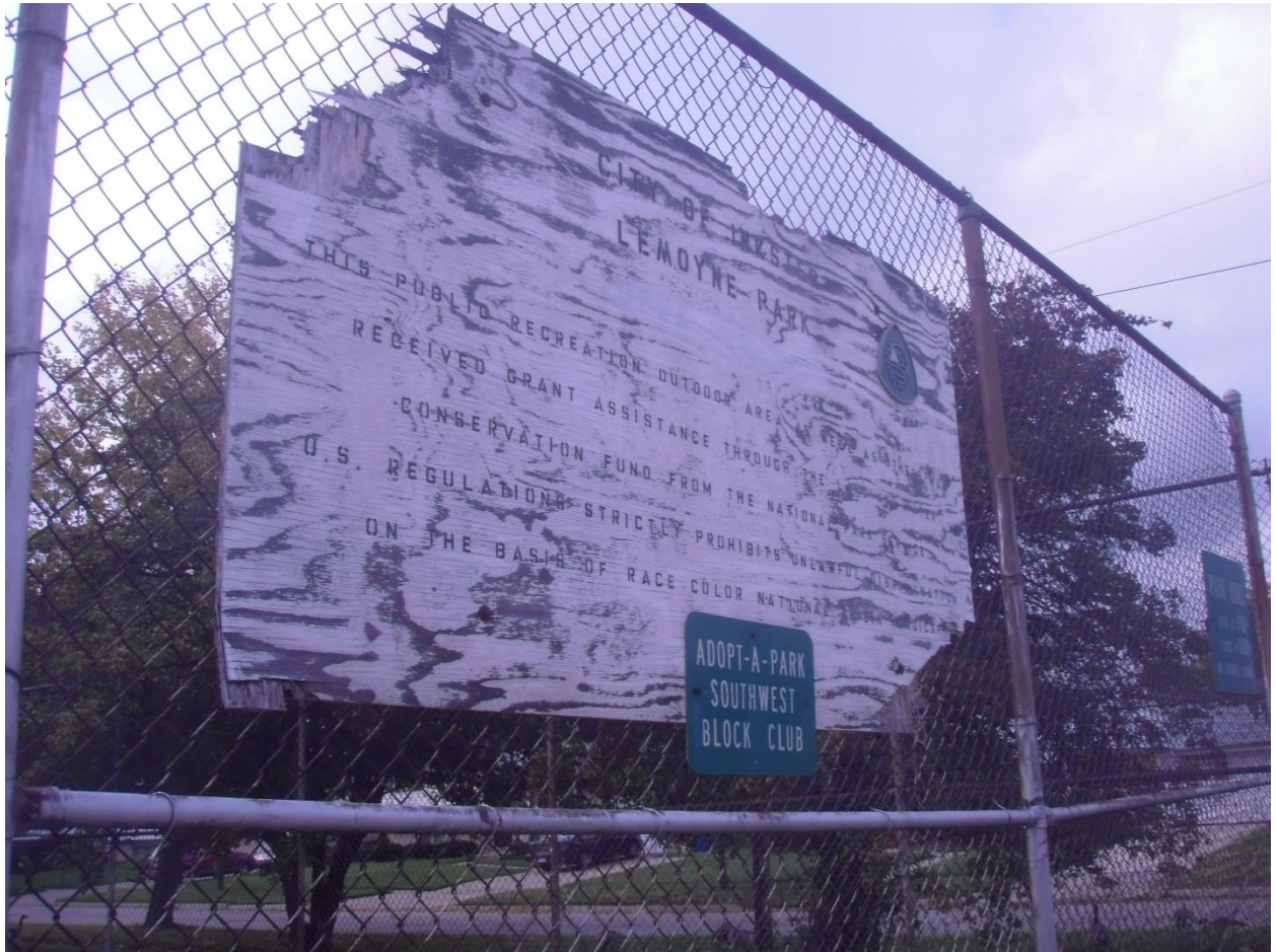
Figure 4 . Lemoyne Park sign with LWCF acknowledgement, adopt a park organization the Southwest Block Club listed and poor conditions in many aspects of the park including the sign.