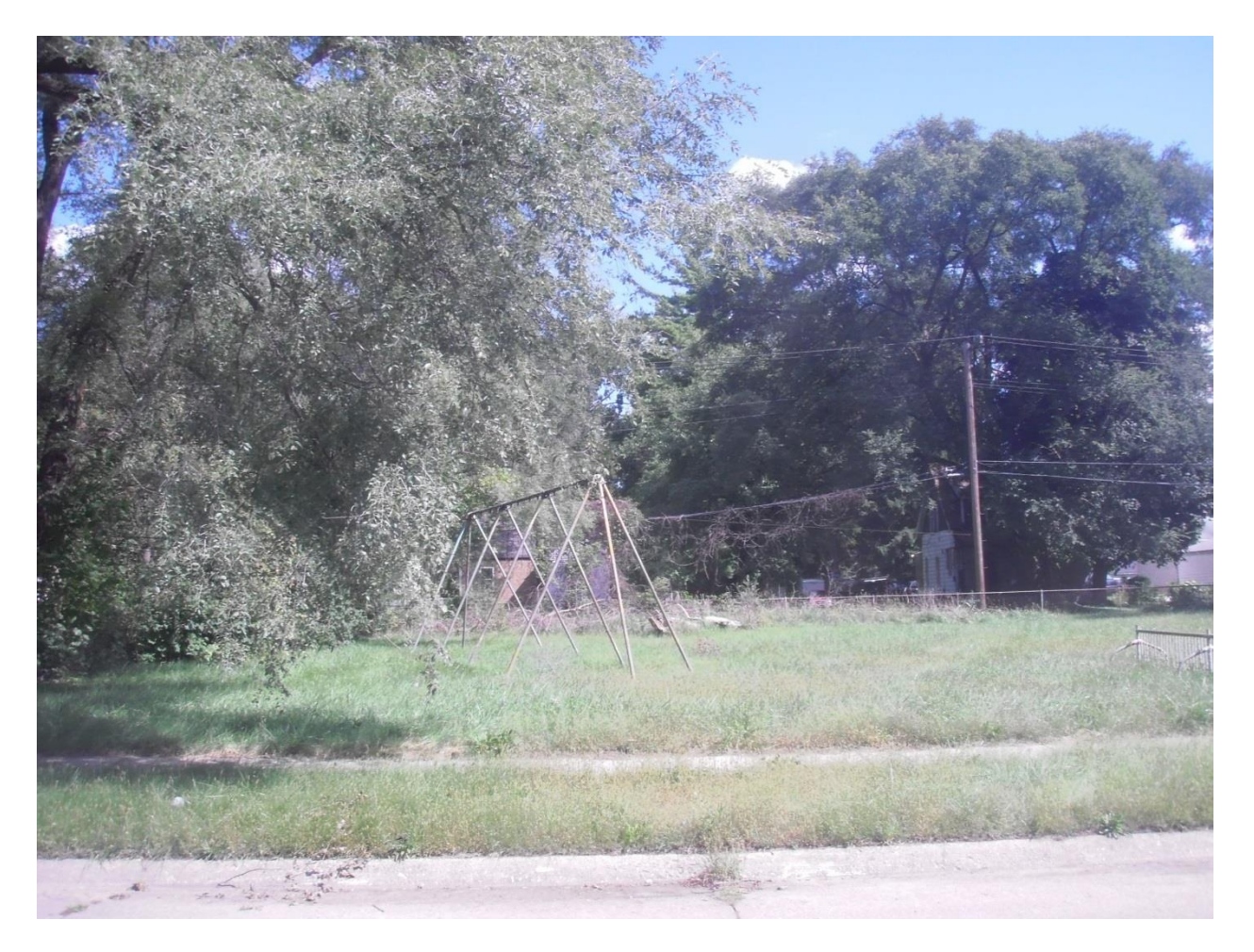
Figure 23. Moore Street Mini park overgrown in Summer 2014. Swing set is missing swings.