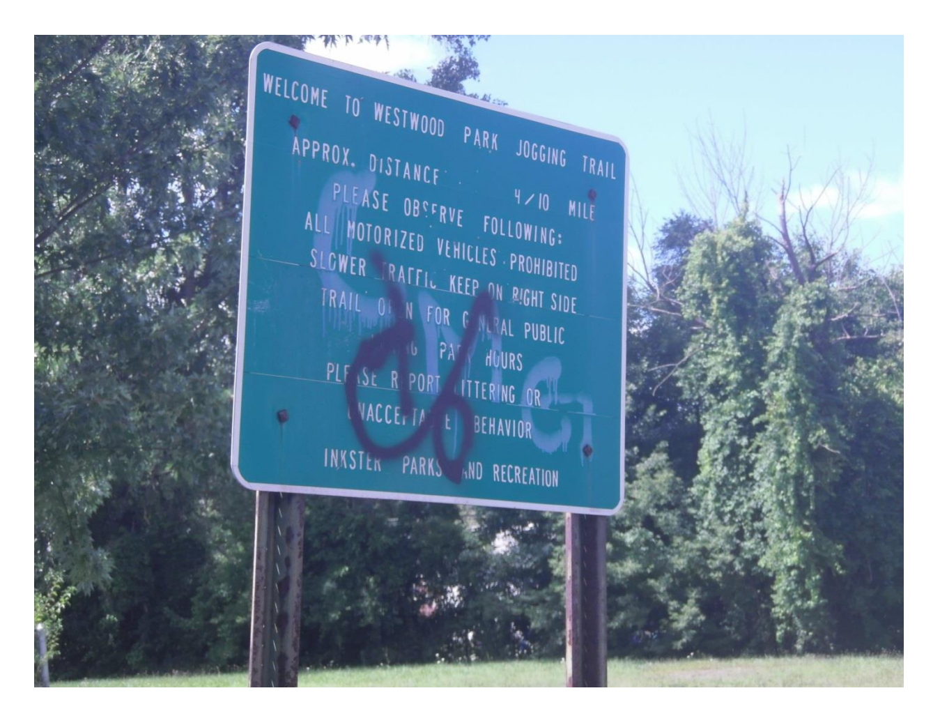
Figure 9. Vandalized sign in Westwood Park welcoming walkers to 0.4 mile trail around park perimeter in Summer 2014. Trail was in serviceable condition, but asphalt was beginning to buckle in places.