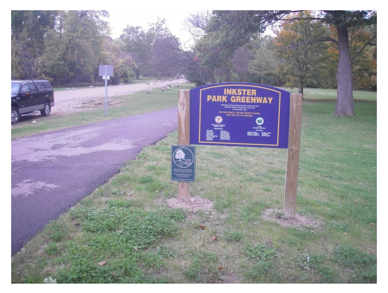
Figure 22. New Inkster Greenway Trail is in excellent condition with MNRTF recognition sign as it winds through Wayne County's Inkster Park.