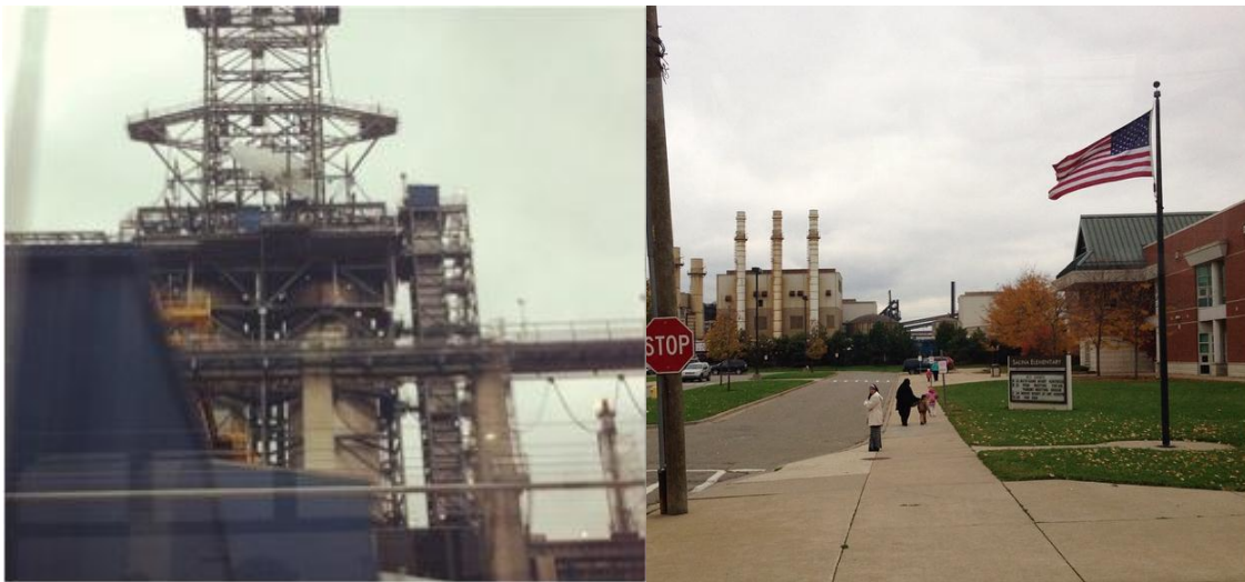
Figure 2 : Industry located next to a school

The zip code of 48217 has been labeled as one of the top most toxic cities in America, let alone the most toxic zip code in all of Michigan. The toxicity is causing problems health wise and living wise. Southwest Detroit has become a very industrialized community and it is a huge problem. The industrial plants in the area are causing all sorts of sicknesses and diseases for its residents. There have been reports of falling dust over this part of the city that contains unusually high levels of lead. The high levels of lead found in this dust are produced by the factories and have been known to very harmful and potentially deadly.